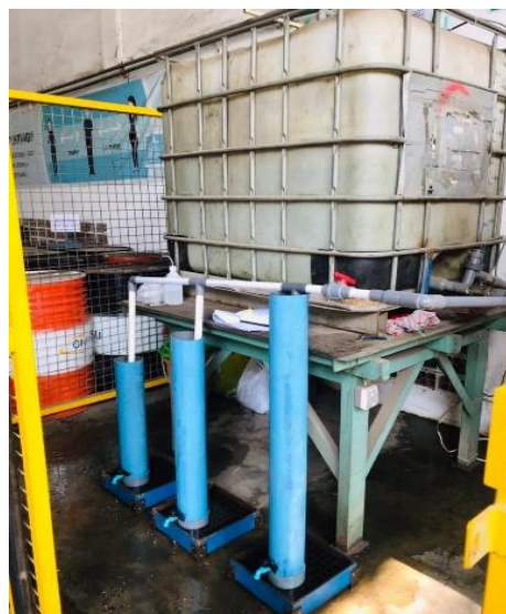
Figure 3. Experiment Tool (this study)

The filter reactor contains zeolite and activated carbon media which are made in various media thicknesses, namely 40 cm, 60 cm, and 80 cm. The size of the zeolite used is 14-20 mesh and the activated carbon is 80 mesh.