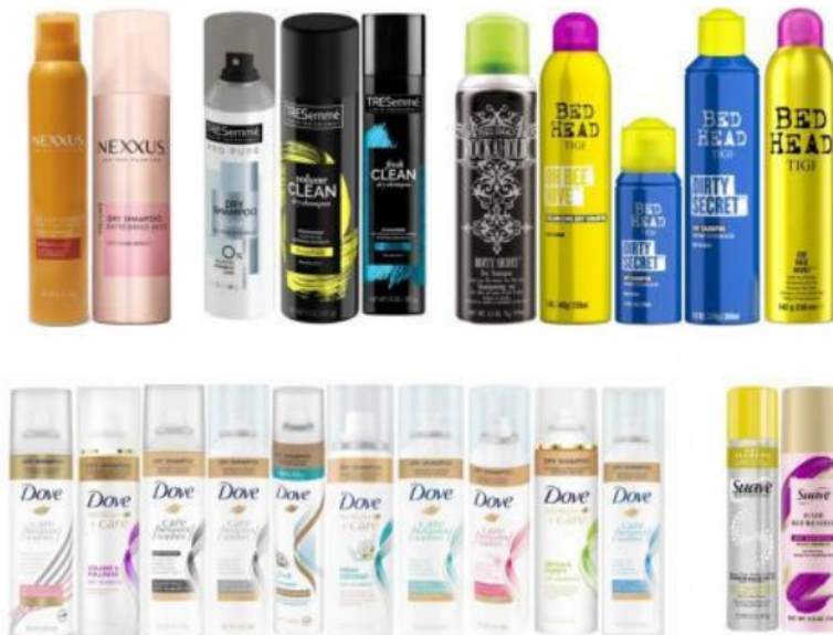
Figure 2. List of Shampoo Products Contaminated with Benzene and Withdrawn from The Market 18-21 October 2022 Source: [13]

Table 1 and Figure 2 shows a list of shampoo products that are potentially contaminated with Benzene. Based on the results of an independent health hazard evaluation, Benzene concentrations were obtained that exceeded the established quality standards. On the U.S. website, The Food and Drug Administration does not specify the concentration of Benzene. Of the 19 shampoo products in Table 1 , 2 shampoo products have been notified in the National Agency of Drug and Food Control (BPOM) Indonesia database. The two products are TRESEMME Volumizing Dry Shampoo, certified at BPOM under the name TRESEMME Volume Clean Dry Shampoo (notification number NE51221000008), and TRESEMME Dry Shampoo Fresh and Clean, certified at BPOM under the name TRESEMME Fresh Clean Dry Shampoo (notification number NE51221000007).